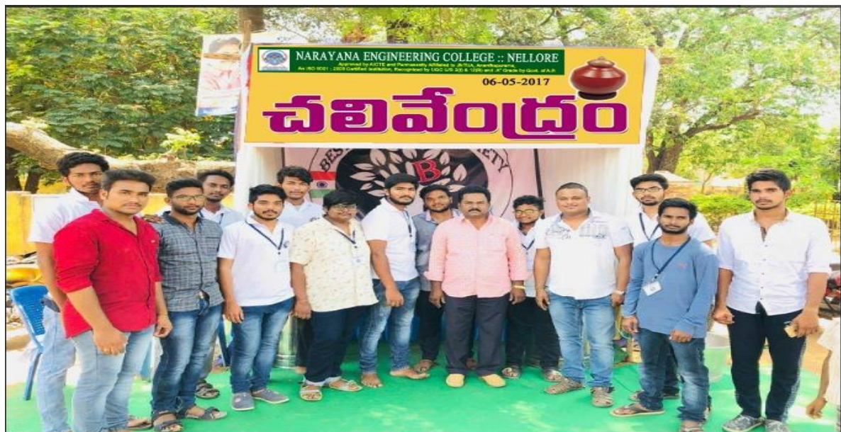
Students of NECN organizing supplying Drinking Water at Haranadhapuram center, Nellore.