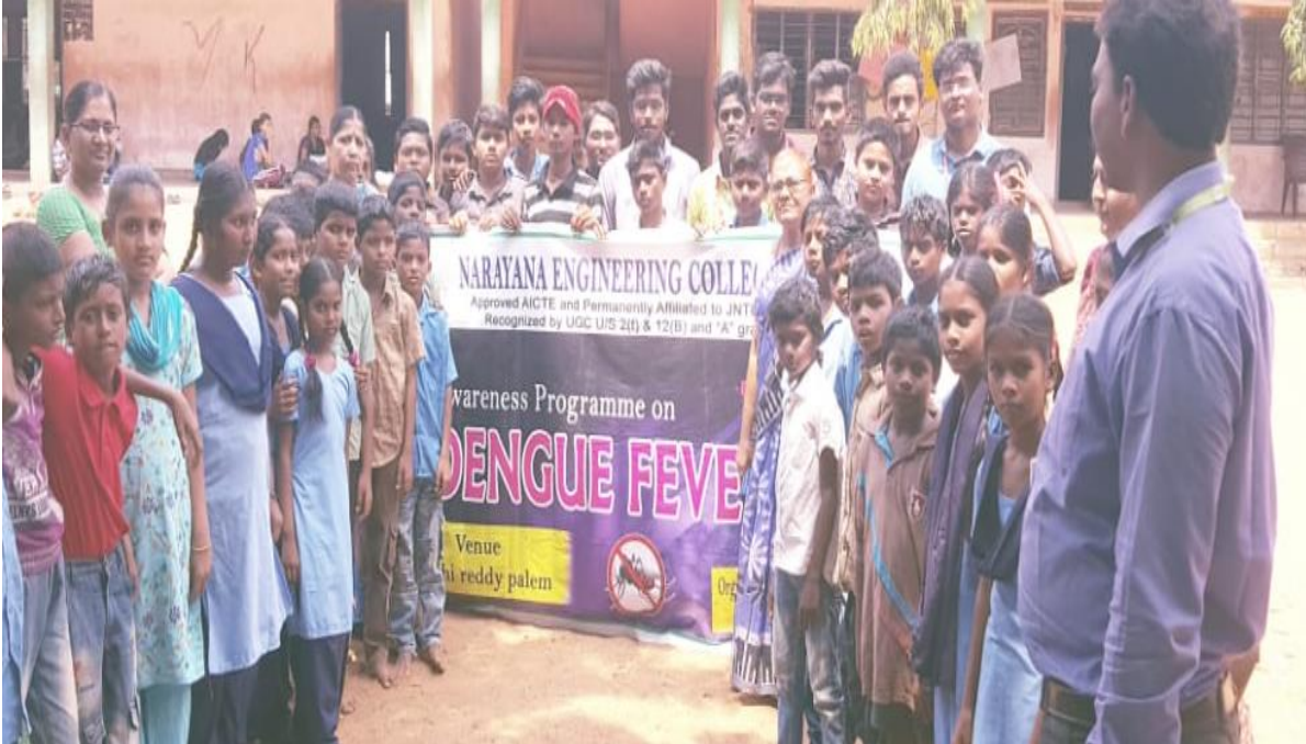
Faculty members conveying message on Swachh Bharat Abhiyan and necessity of Toilets, Liquid waste disposal system, Village Cleanliness and explained about personal Hygienic , Home Sanitation, Safe drinking water, Garbage Disposal etc.,