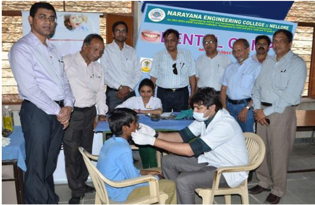
Doctors testing villagers at Dental check-up Camp.