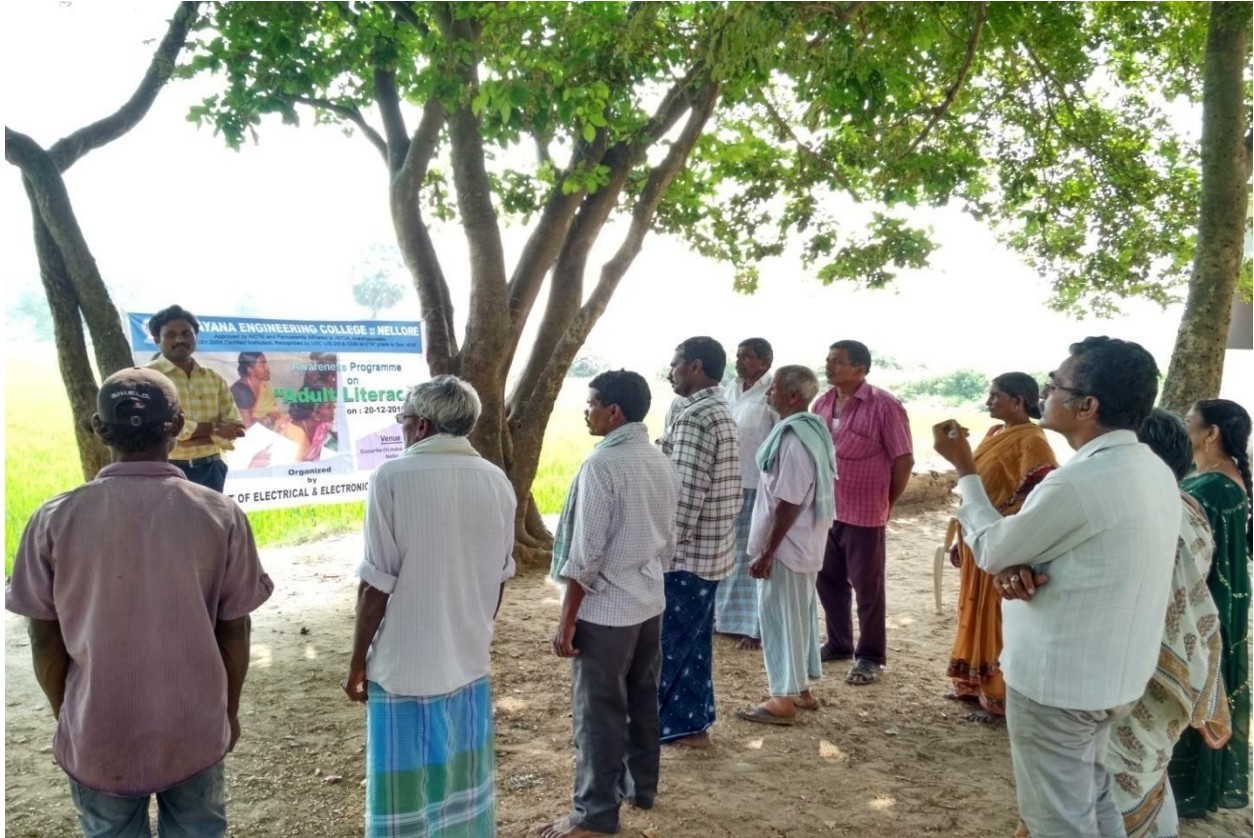
Faculty member explaining the importance of Adult Literacy to the villagers