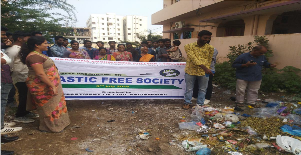
Staff explaining harmful effects of plastic waste at Balaji Nagar, Nellore