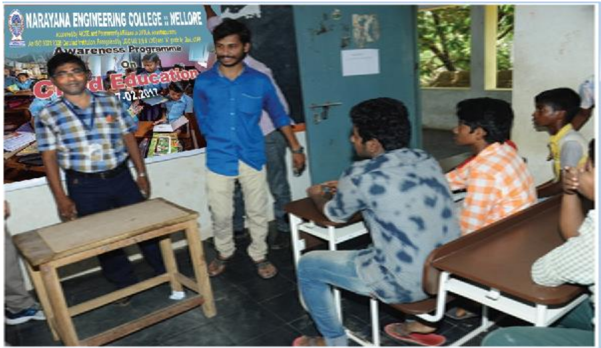
MCA Staff of NECN explaining the importance of Child Education.