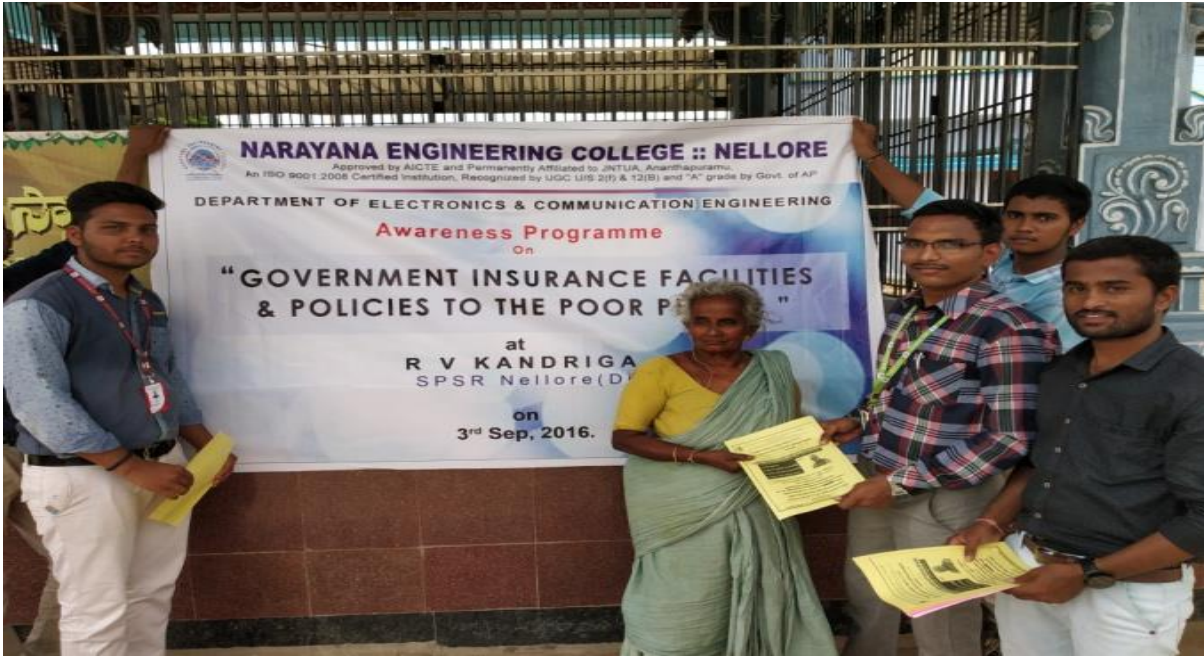
Faculty explanation on Govt. Schemes and Policies to the villagers as well as distribution of the hand outs to them.