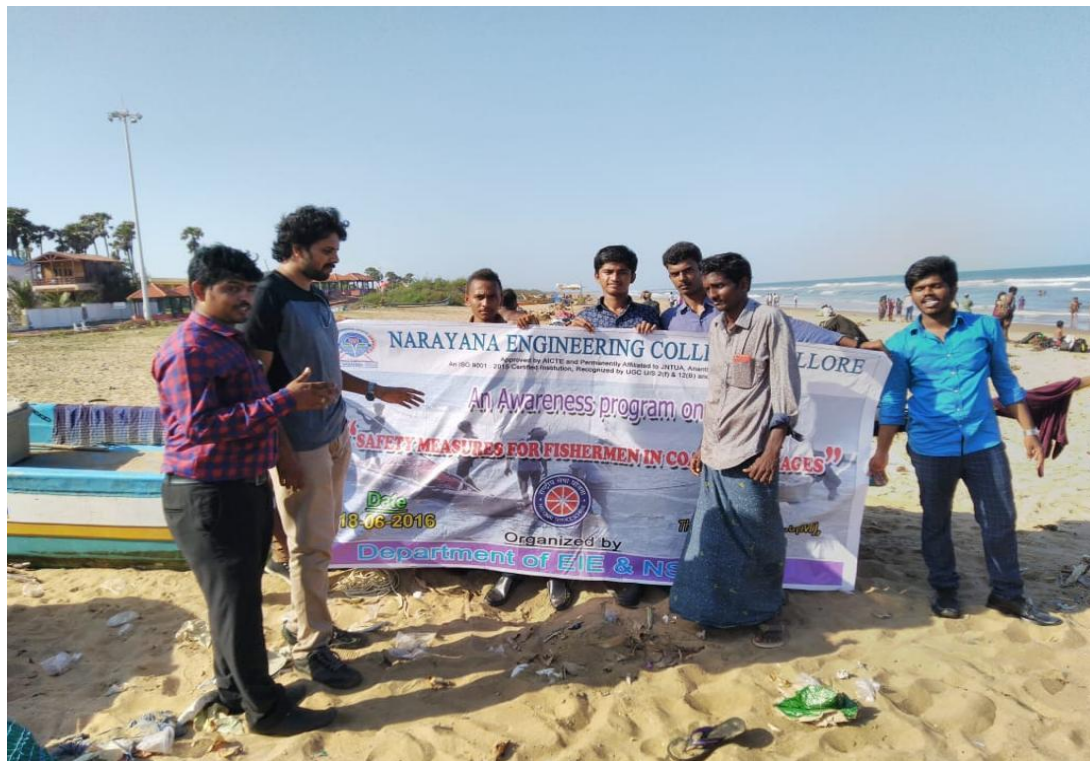
Staff members explaining safety measures to be taken by fishermen during cyclones