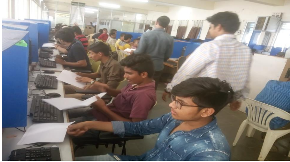
Senior Intermediate students are writing Mock EAMCET TEST at NECN